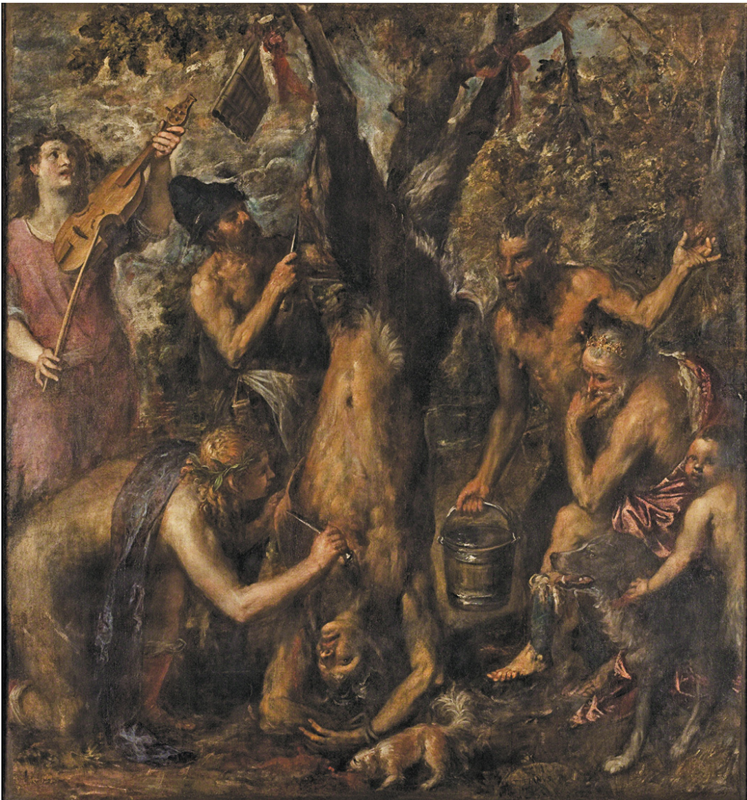
Titian, The Flaying of Marsyas , ca. 1570s, oil on canvas, 86 5/8 × 80 5/8".

The point-cloud aesthetic that is the foundation of Carver's recent paintings suggests biological matter sublimated into the virtual, figures opened up into ideas, and the confluence of the historical with the sci-fi present. The way it feels to be alive has changed a great deal over the past decade: The ways we represent ourselves and communicate, and the places our identities reside, are increasingly located in images in digital space. "The figurative painter," Carver writes, "must reckon with the material body as something that was once central to identity but may soon only function as a form of frailty and finitude that is eclipsed by a post-human, post-body form of being in the world." Bodies are becoming dematerialized, and this is the perfect time to find new ways of representing the human (and inhuman) figure.