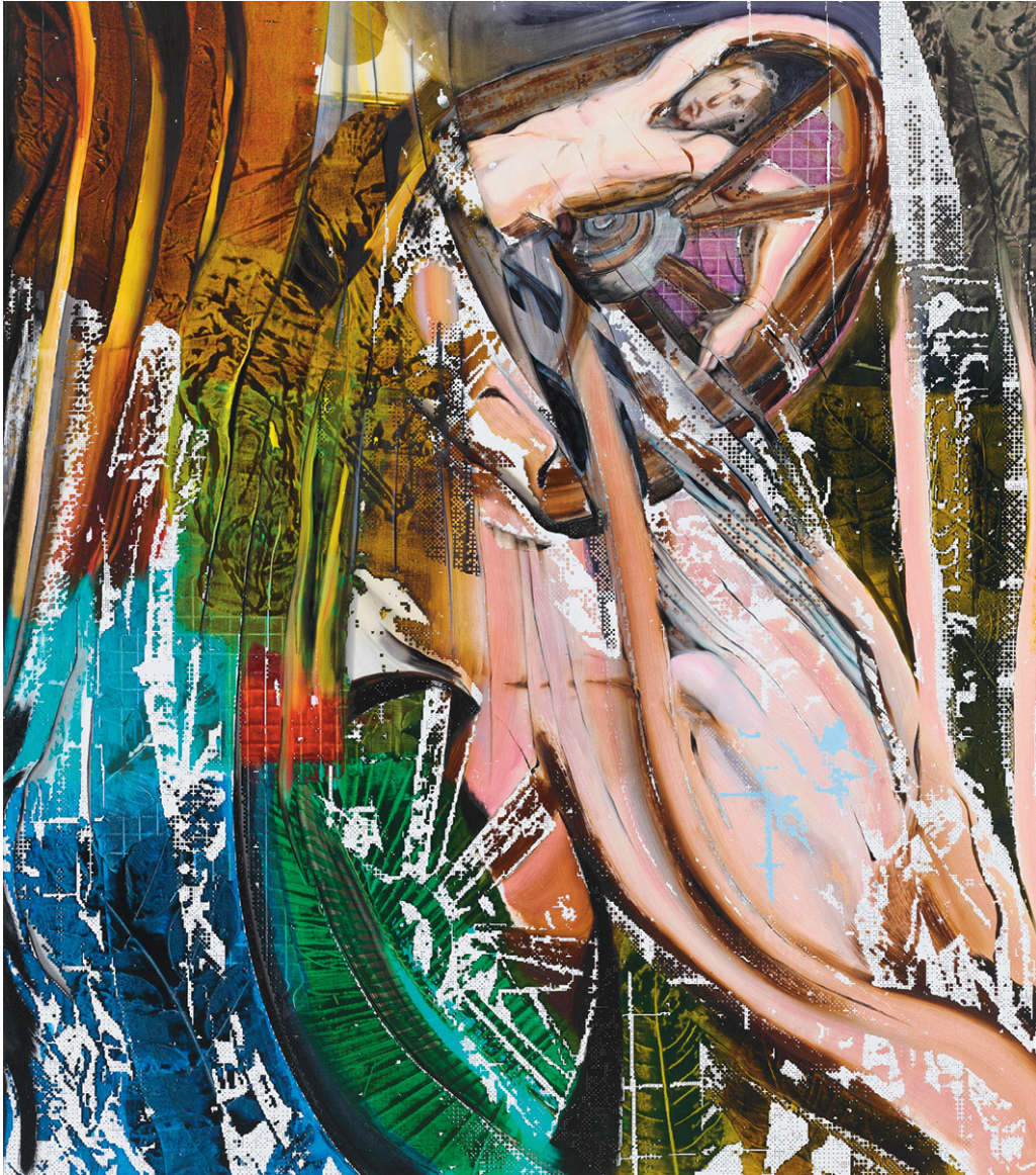
Alex Carver, The Spinning Wheel (Ribboned Flesh) , 2023, oil on linen, 88 1/4 × 78".

Carver’s recent paintings suggest biological matter sublimated into the virtual, figures opened up into ideas, and the confluence of the historical with the sci-fi present.