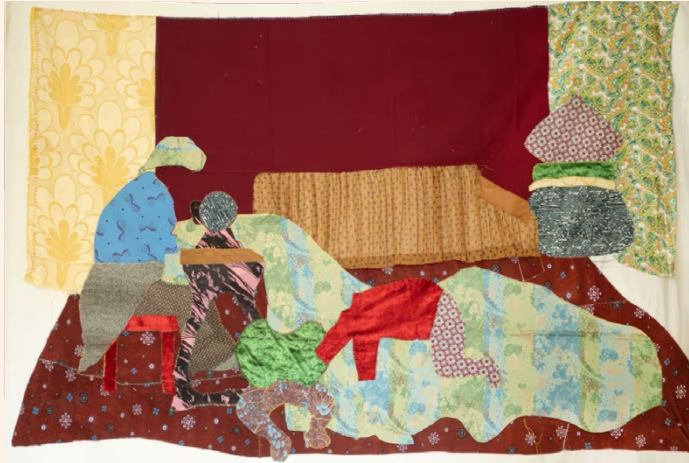
'In the room of memory' (2023) by Dariya Nurtaza © Courtesy the artist/Pygmalion Art Gallery

international politics, energy resources and initiatives such as China's Belt and Road Initiative, also known as the New Silk Road, has piqued global interest in central Asian artists in recent years, she says.