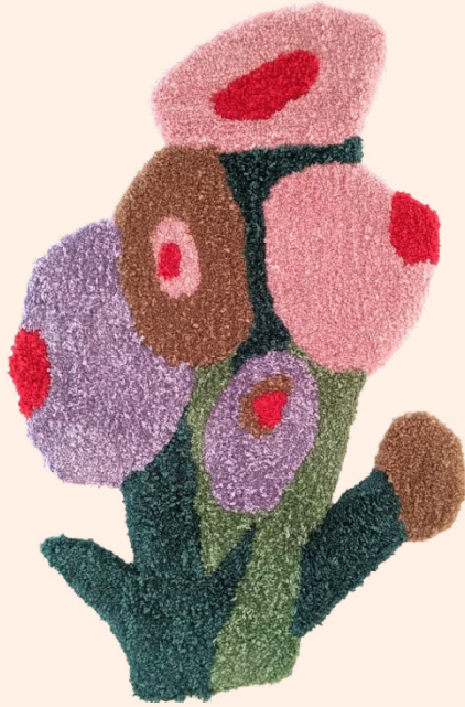
'Breast Collection' (2021)...

The central Asian art scene and society, with its contentions and complexities, its popular culture, its myths and esoteric traditions, have been Slavs and Tatars' focus for many years, from both an artistic and a curatorial standpoint. For Asia Now, the collective will create a chaikhaneh (tea house) and a reading room, consisting of an Eurasian-style salon with literature on the arts of the region, hosted in a Kazakh yurt in the courtyard of the Monnaie, Paris's mint.