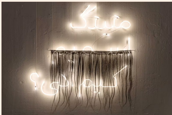
'What Was My Name' (2020) by Saodat Ismailova

Contemporary art of the region — an enormous landlocked area which Slavs and Tatars defines as “east of the former Berlin Wall and west of the Great Wall of China”, encompassing Kazakhstan, Uzbekistan and the other “stans” — will be the focus of the ninth edition of the Asia Now fair in Paris (October 20-22), which Slavs and Tatars are guest curating. While gathering attention at an institutional level, there is still relatively low market demand for art from the region, in part thanks to political complexities and a cultural identity that is difficult to pin down. The fair hopes to start redressing that.