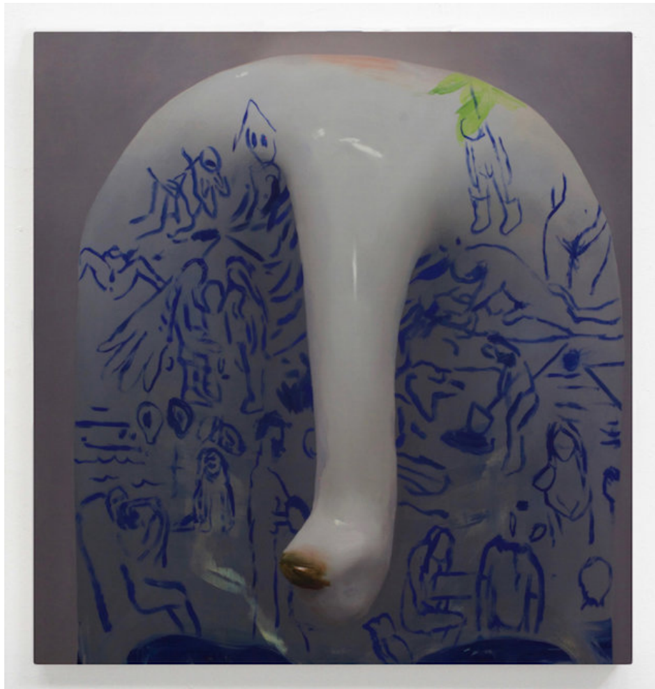
Ambera Wellmann, "Temper Ripened," 2017.