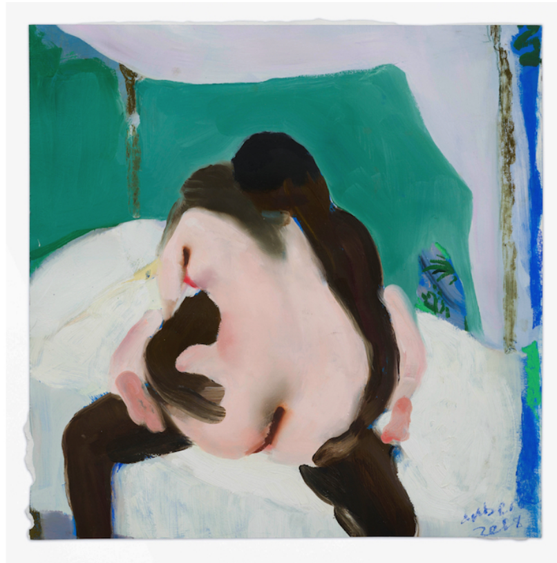
Ambera Wellmann, "Coverers," 2018.

BY SKY GOODDEN ( HTTP://MOMUS.CA/AUTHOR/SKYGOODDEN/ ) • • NOVEMBER 13, 2018