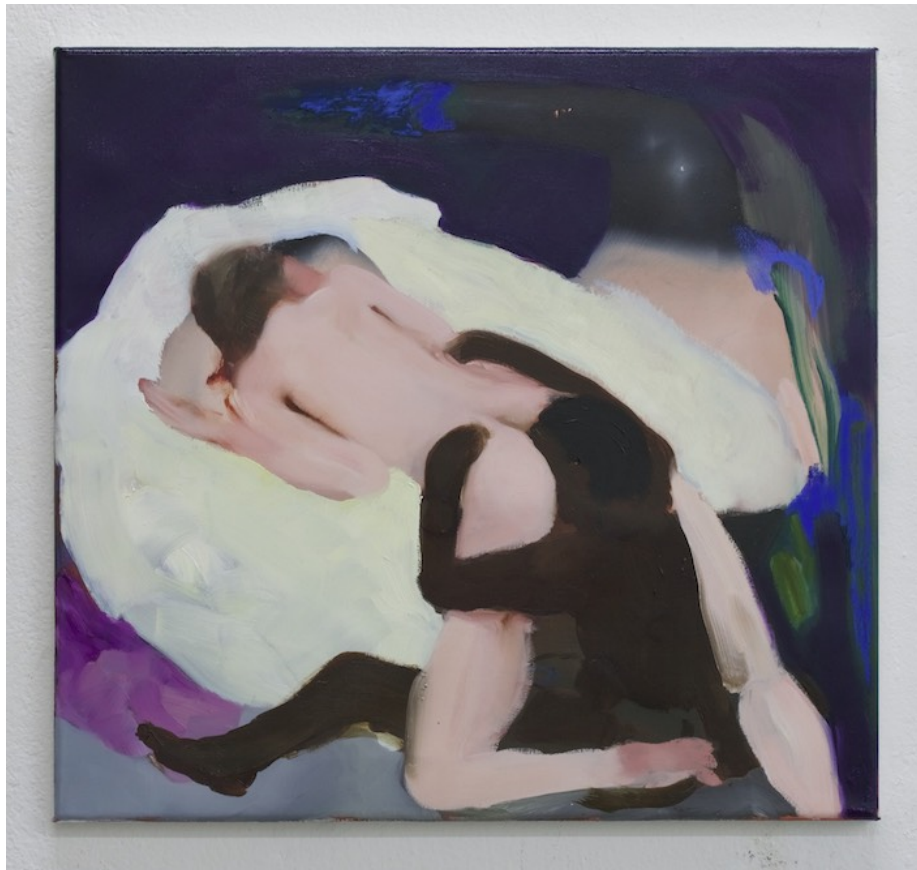
Ambera Wellmann, "Ass Eater," 2018.

Tell me about the feminist aspect of your practice. A lot of the new press around your work is aligning itself to that perspective, or agenda, and it strikes me that that could be uncomfortable for you. How does it sit?