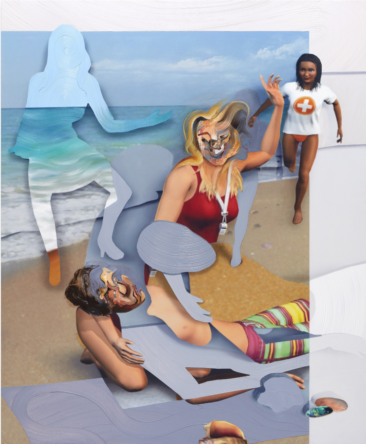
PIETER SCHOOLWERTH Shifted Sims #6 (Tropical Romance Island Community Event), 2020 Oil, acrylic, inkjet on canvas 70 x 58.5 in 177.8 x 148.6 cm