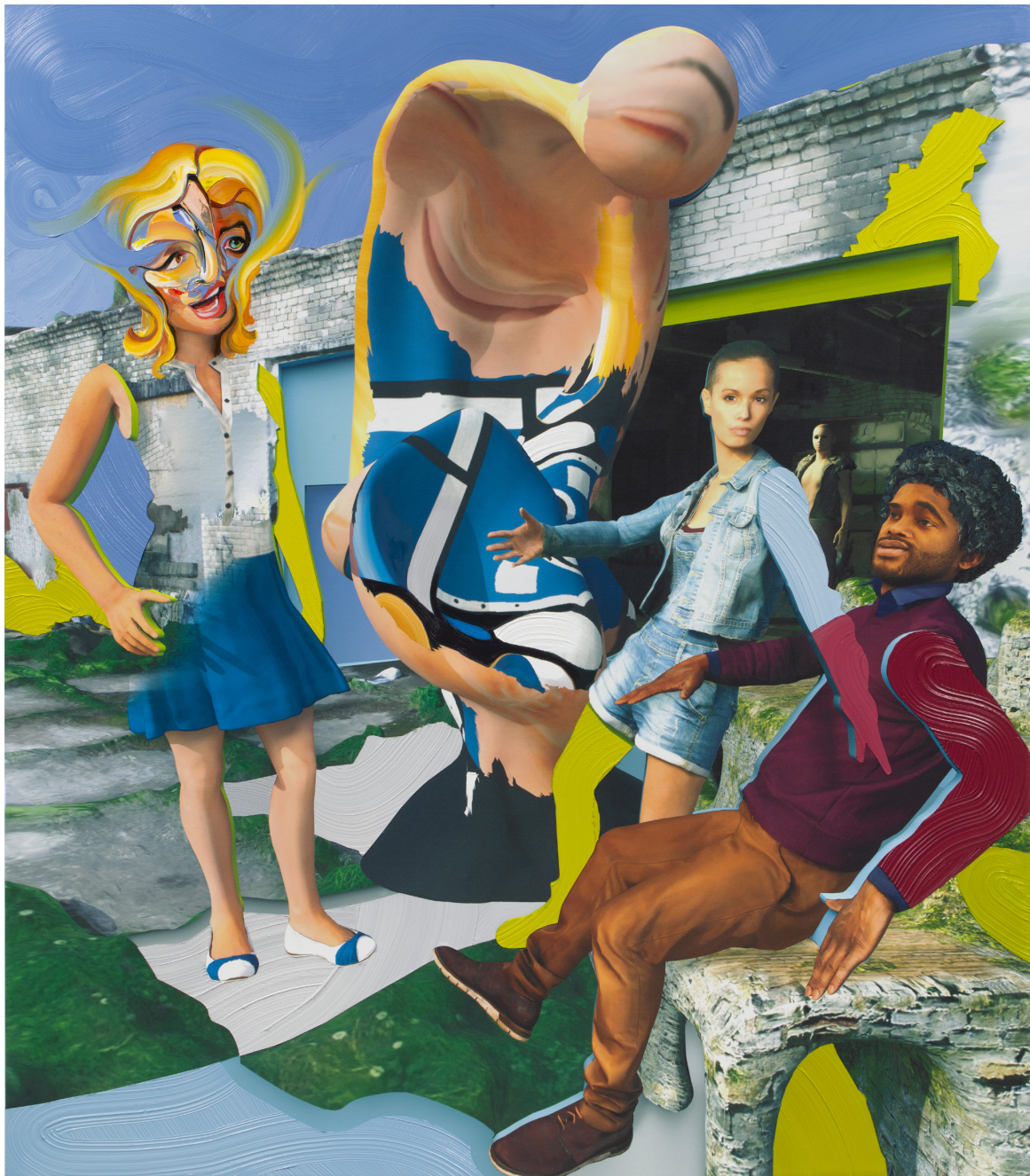
PIETER SCHOOLWERTH Today's Outside Critique (Rigged #13) 2021 Oil, acrylic, inkjet on canvas 66 x 57.5 in 167.6 x 146.1 cm