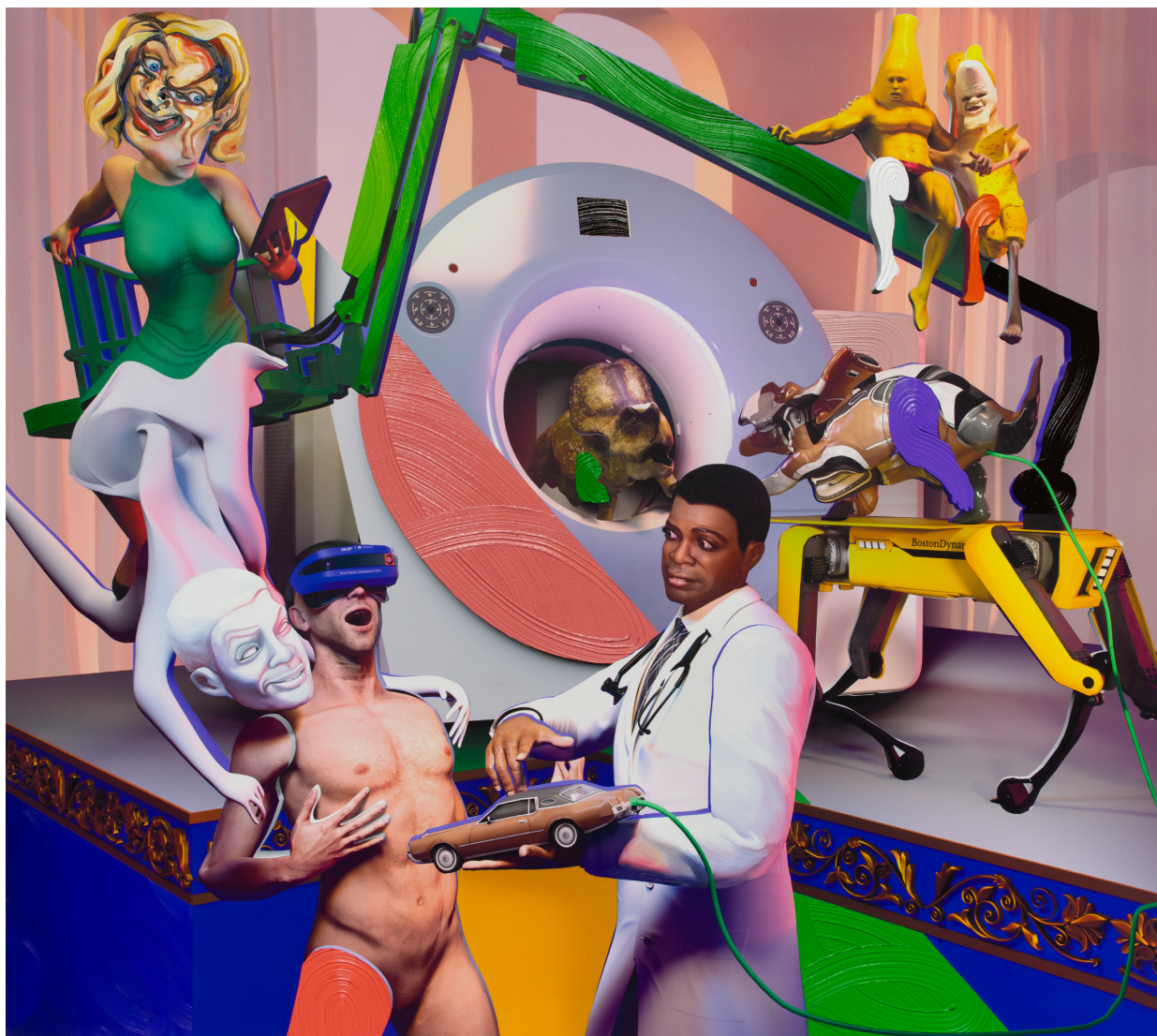
PIETER SCHOOLWERTH Sharon is Karen (Rigged #23), 2022 Oil, acrylic, inkjet on canvas 80 x 90 in 203.2 x 228.6 cm