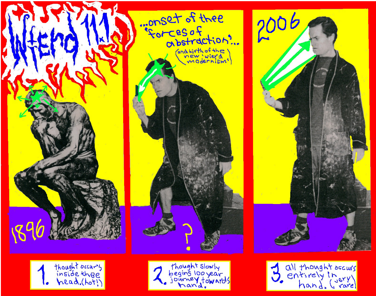
PIETER SCHOOLWERTH Wierd Party, weekly invitation flier, 2005 (by Pieter Schoolwerth)