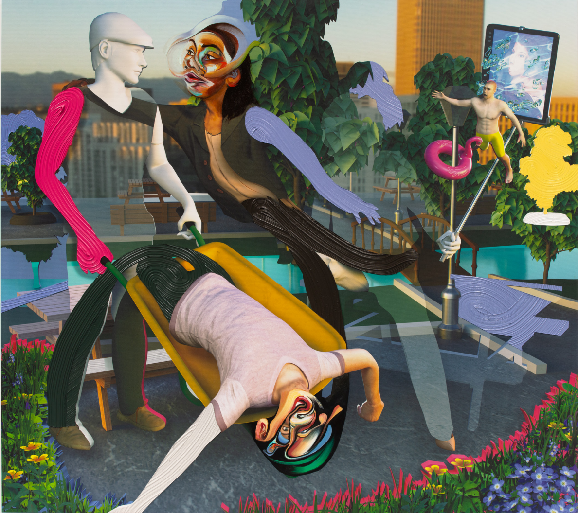
PIETER SCHOOLWERTH The Architect of Wheelbarrow Park (Rigged #22), 2022 Oil, acrylic, inkjet on canvas 54 x 62 in 137.2 x 157.5 cm