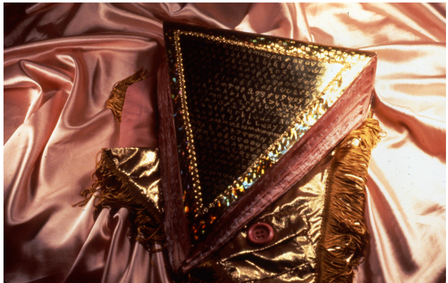
PIETER SCHOOLWERTH Alphabet 1991 Pencil on paper 18 x 24 in 45.7 x 61 cm

a ā a d e f g h i j k l m n o p q r s t u v w x y z b c d e f g h i j k l m n o p q r s t u v w x y z c d e f g h i j k l m n o p q r s t u v w x y z d e f g h i j k l m n o p q r s t u v w x y z e f g h i j k l m n o p q r s t u v w x y z f g h i j k l m n o p q r s t u v w x y z g h i j k l m n o p q r s t u v w x y z h i j k l m n o p q r s t u v w x y z i j k l m n o p q r s t u v w x y z j k l m n o p q r s t u v w x y z k l m n o p q r s t u v w x y z l m n o p q r s t u v w x y z m n o p q r s t u v w x y z n o p q r s t u v w x y z o p q r s t u v w x y z p q r s t u v w x y z q r s t u v w x y z r s t u v w x y z s t u v w x y z t u v w x y z u v w x y z v w x y z w x y z x y z y z z