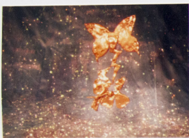
PIETER SCHOOLWERTH Thee Space Between, page 29 1991, Audiobook 29 minutes