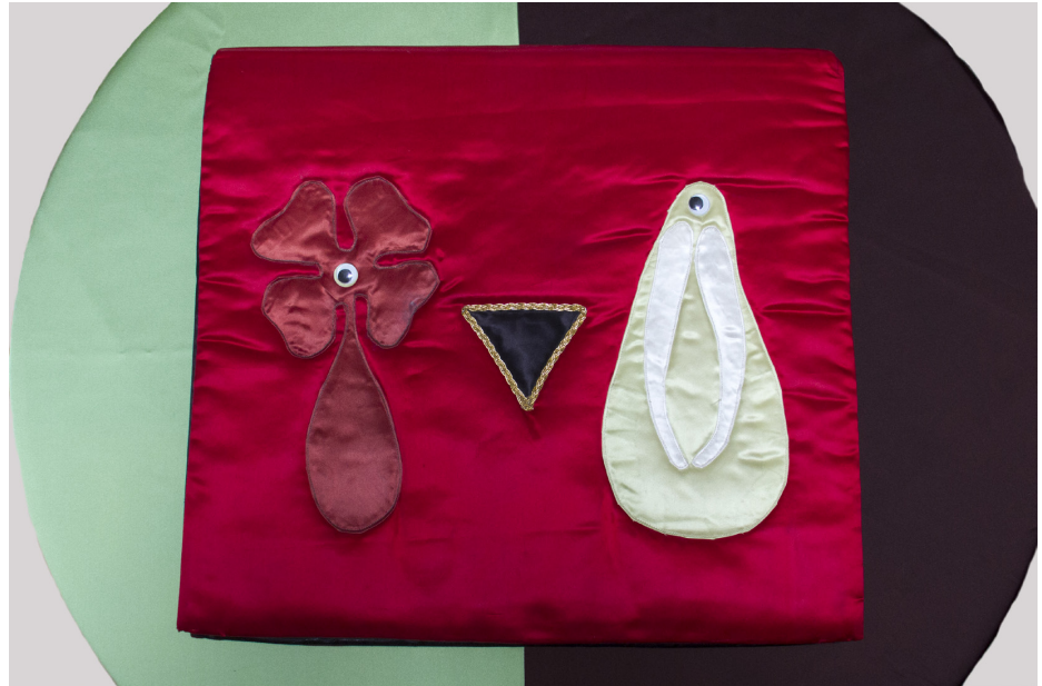
PIETER SCHOOLWERTH Thee Space Between (Cover) 1991 Audiobook 29 minutes 171.5 x 163.2 cm