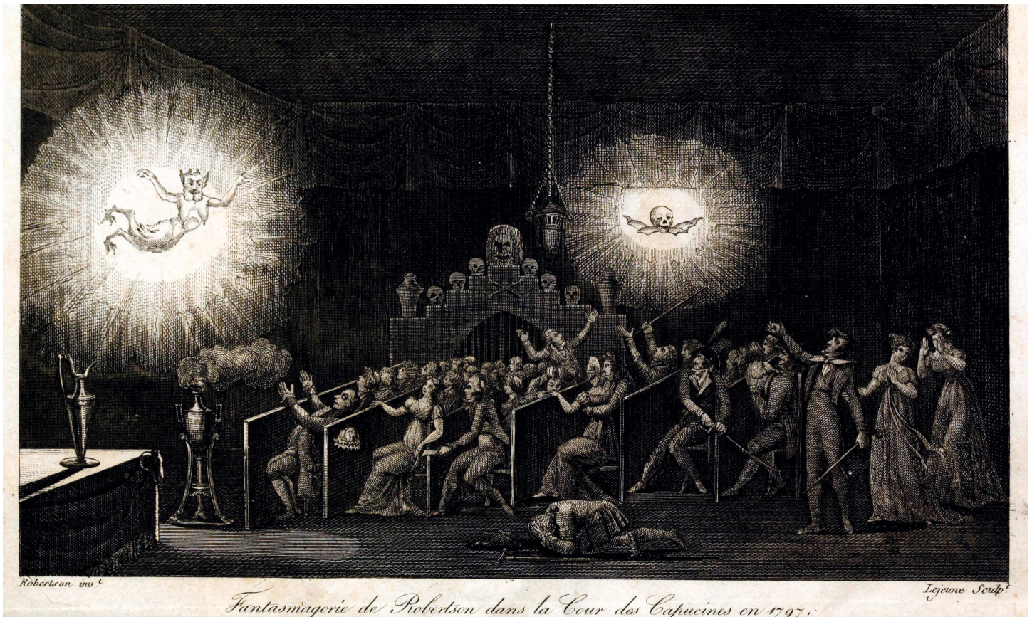
Artist Unknown, Robertson's phantasmagoria, Paris, 1797