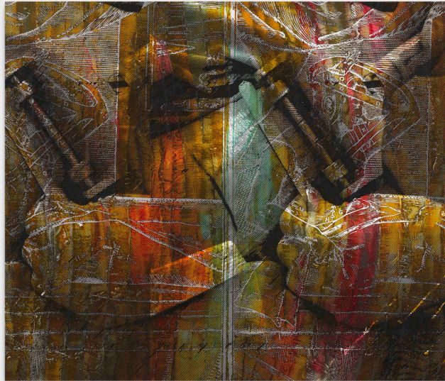
Alexander Carver The Intruder, 2020 oil on linen 152 x 178 x 3 cm unique

Eclipsing a complete view of the Renaissance figure (embedded within dense frottage of woven material) is an image of a modern surgical tool used for skin-graft harvesting, rendered in thick black lines of oil paint. Within these black lines, two sequential impressions of a crude instrument are discernable. A device containing a simple roller and a handle appears to glide across the surface of the painting.