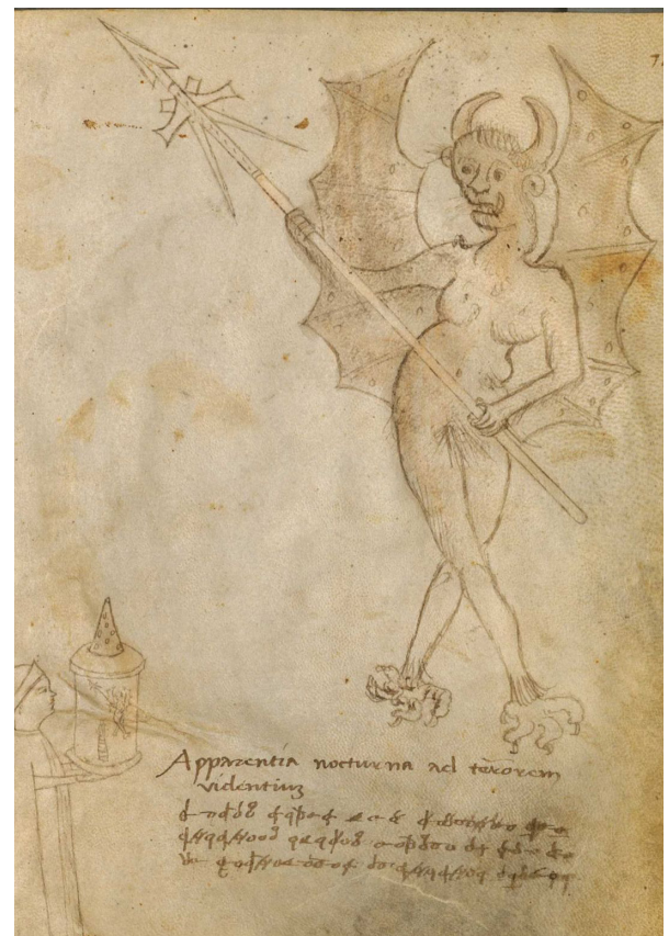
Giovanni Fontana, a figure with lantern projecting a winged demon, 1420