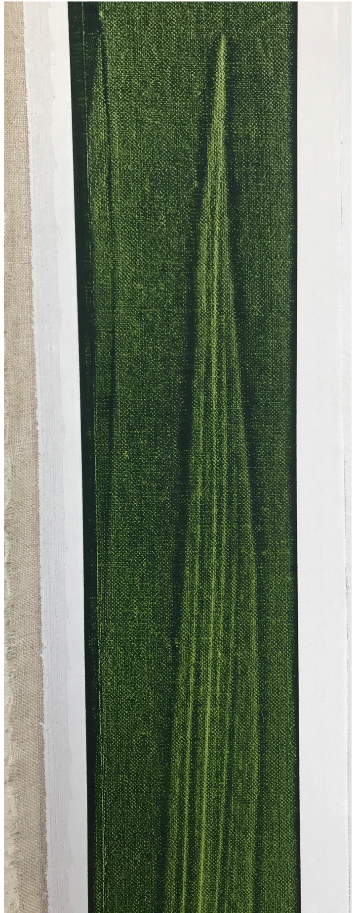
Frottage test strips of of surgical tools (left) and reed (right) by Alexander Carver, 2020