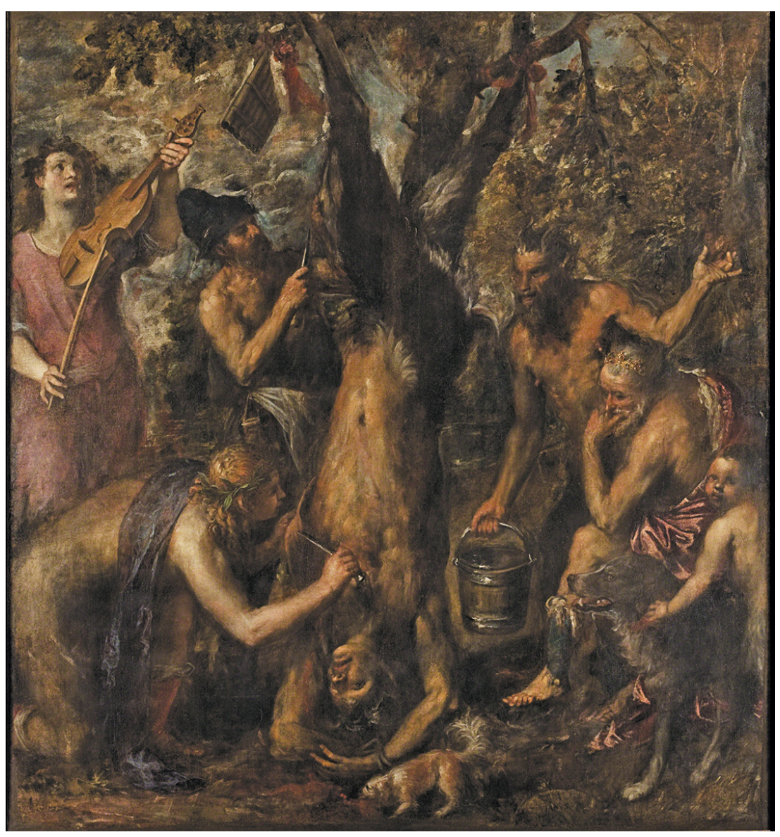
Titian, The Flaying of Marsyas, ca. 1570s, oil on canvas, 86 5/8 × 80 5/8".

The point-cloud aesthetic that is the foundation of Carver's recent paintings suggests biological matter sublimated into the virtual, figures opened up into ideas, and the confluence of the historical with the sci-fi present. The way it feels to be alive has changed a great deal over the past decade: The ways we represent ourselves and communicate, and the places our identities reside, are increasingly located in images in digital space. "The figurative painter," Carver writes, "must reckon with the material body as something that was once central to identity but may soon only function as a form of frailty and finitude that is eclipsed by a post-human, post-body form of being in the world." Bodies are becoming dematerialized, and this is the perfect time to find new ways of representing the human (and inhuman) figure.