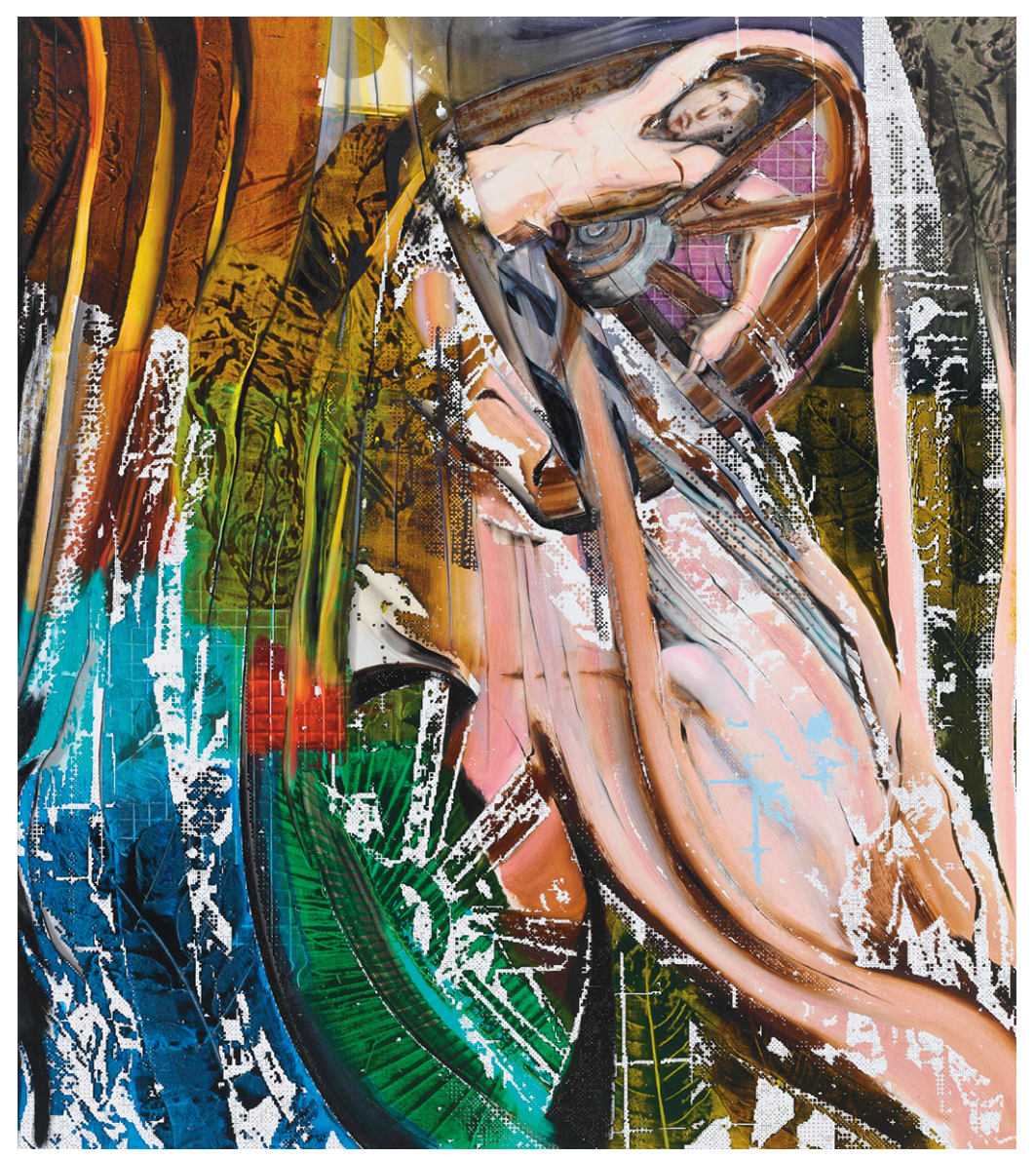
Alex Carver, The Spinning Wheel (Ribboned Flesh), 2023, oil on linen, 88 1/4 × 78".

Carver's recent paintings suggest biological matter sublimated into the virtual, figures opened up into ideas, and the confluence of the historical with the sci-fi present.