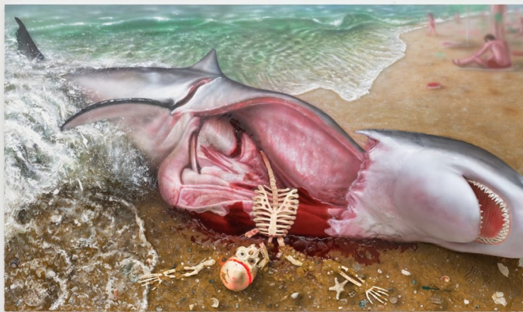
A recent work by Trey Abdella.

Unique process: “I spend a lot of time on Photoshop thinking about how to further manipulate the images to my very specific narrative. Lately, I have been incorporating different materials and textures into the works like an assemblage. I’m always wondering, How do I intensify the drama and make this even more ridiculous?”