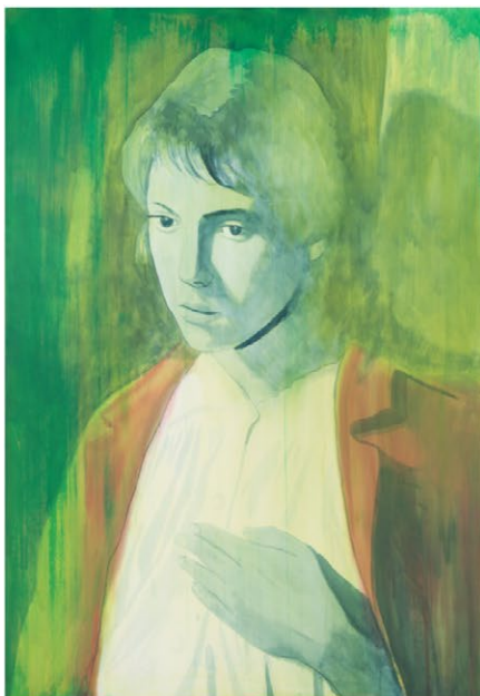
Brook Hsu, Marie (2025). Ink on canvas. 162 x 112.5 cm.