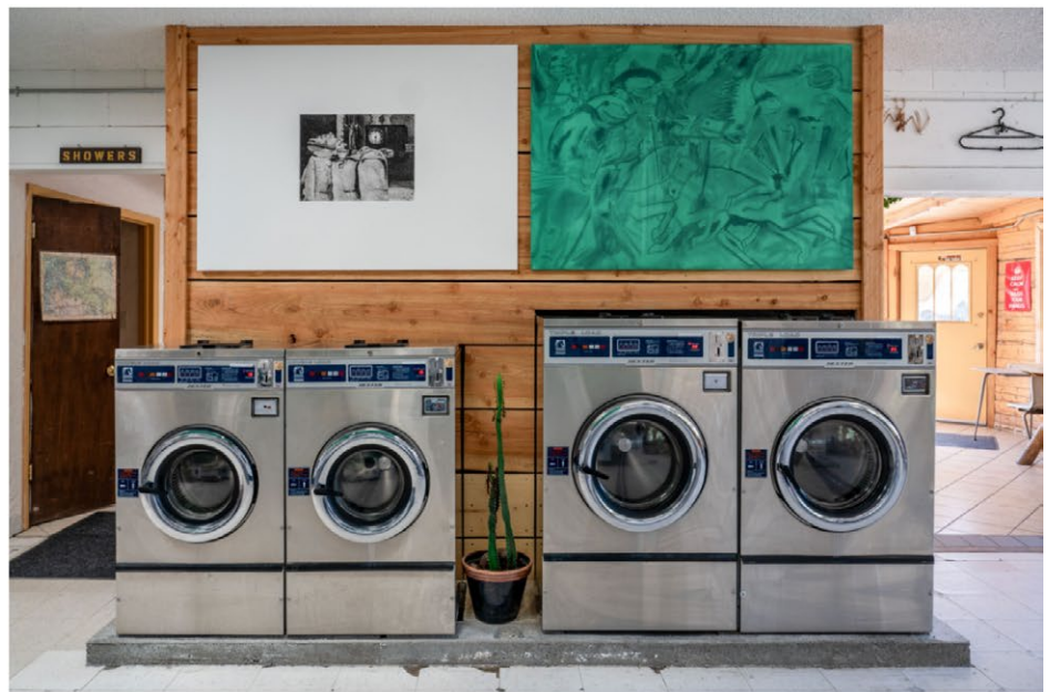
Exhibition view: Brook Hsu and Louis Eisner, Frogs , Bortolami, New York (2025).