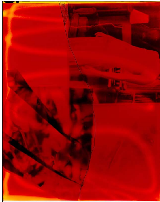
Ketuta Alexi-Meskhishvili, G-Hands , 2026, dye sublimation on aluminium, 1.3 × 1 m.

The luminosity of colour in Ketuta Alexi-Meskhishvili's work is so seductive that I often want to touch her surfaces, hoping the shades might soak into my skin. Alexi-Meskhishvili treats photography as an unstable medium. Rather than attempting to capture a moment or construct an image, she prioritizes the developmental process, which unfolds in ways that suggest expansion rather than fixity. In 'Georgia' at Galerie Molitor, she brings together a group of analogue c-prints and dye-sublimation prints on aluminium in low-lying, table-like frames that suggest themes of doubling and unknown thresholds. A female form surfaces and recedes, which speaks to the artist's recent discovery of a close relative through DNA testing. There is something bodily and cellular about the compositions, with deep washes of red and yellow holding shapes that come in and out of focus. Alexi-Meskhishvili turns photography lusciously visceral.