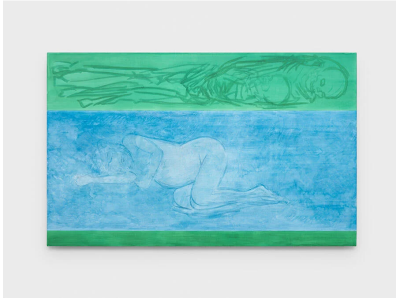
Brook Hsu, Hope , 2026, ink and pencil on canvas, 102 × 162,6 × 2,7 cm.

The grand, diaphanous expanses of aquamarine that define Brook Hsu's new suite of ink and pencil paintings engender a mysterious, nostalgic melancholy. Her subject matter is Ludwig Mies van der Rohe's and Lilly Reich's temporary Barcelona Pavilion, designed for the 1929 International Exposition and featuring Georg Kolbe's sculpture Morgen (Dawn, 1925), a long-limbed woman stretching her arms into daylight. The building was demolished almost immediately after the show. Hsu enfold a sense of bodily intimacy into stark, minimalist planes, repeatedly depicting a pregnant figure and a skeleton enmeshed within the building and bands of blue – an oblique meditation on a woman living through the loss of her child. Her spatial propositions are at once symbolic expanses that hold the body and suffocating graves. Shown alongside Hsu's canvases, drawings and photographs is Kolbe's touching bronze sculpture Nacht (Night, 1930), on loan from Berlin's Georg Kolbe Museum, in which a woman shields her face as day symbolically shifts into night.