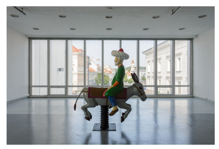
Slavs and Tatar, Molla Nasreddin the antimodern , 2012. Fibreglass, laquer paint, steel, 180 x 180 x 80 cm