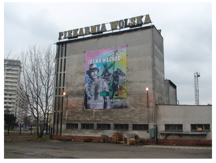
Slavs and Tatars, Idź na Wschód!, 2009. Digital print on PVC, 750 × 100 cm. Installation view at Wola Art Festival, Warsaw.

artists organized a coach trip from Warsaw to Kruszymany, an eastern Poilsh border town where Polish Muslims live and cultivate their traditions. Charles Bronson owes his sharp features and oblique eyes to his ancestors who emigrated to the United States from eastern Poland. This trip to the nearest exotic orient made its participants aware that the alien Tatar is part of us.