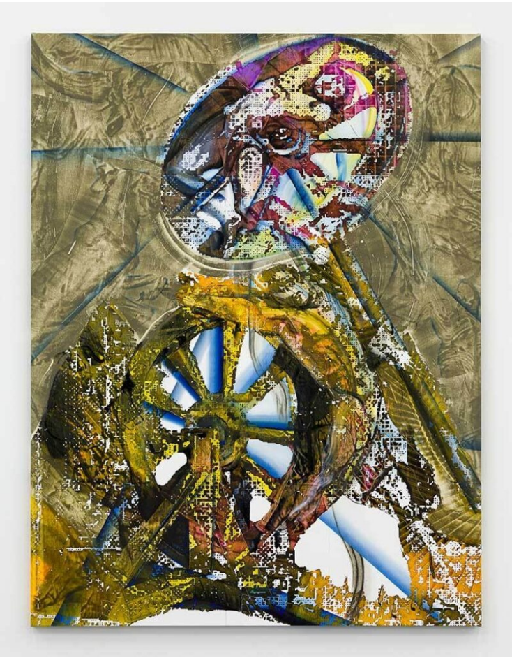
Alex Carver, Two Wheels , 2022, oil on linen, 79 \times 60 inches.

At that time, I was struggling with the problem of composition in painting. I was working very diagrammatically. I was using texts from patents, so there was a givenness to the question of composition. I had a moment when I didn't know what kind of images I was trying to make, so this idea of "external fixation" was useful for me in asking myself, "What is going to lend me compositional support?" The procedure of making the painting —in a classic postmodern strategy—also showed up in the work. I started painting trompe I'oeil images of the vinyl and the tape that I use to make the paintings. In addition to the fear of my father's aortic aneurysm, the show was about very basic painting problems: What kind of marks am I making? What is a composition? Does composition matter?