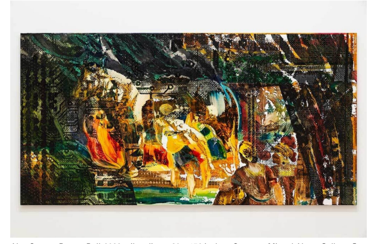
Alex Carver, Brazen Bull, 2022, oil on linen, 80\times156 inches.

In Alex Carver's practice, the painterly apparatus—its tools, techniques, and history—is self-reflexively matrixed through the lens of extra-aesthetic discourses related to the breakdown and reconstitution of the body. In addition to the creation of paintings that index their own conditions of possibility, his work lends a distinct approach to the question of "figuration," framing it as an allegorical process in which the body of the art object undergoes critical interrogation. While an earlier series took surgery, specifically grafting, as its thematic center, in Carver's current exhibition at Miguel Abreu, Engineer Sacrifice , he plumbs the painterly subcurrents of medieval torture devices in which immolation and dismemberment double as aesthetic strategies.