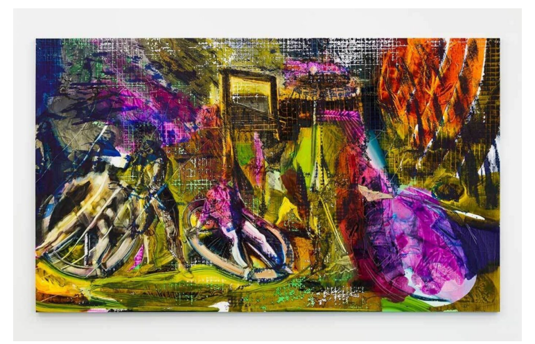
Alex Carver, The Work of Wheels , 2022, oil on linen, 78 x 132.5 inches. Courtesy Miguel Abreu Gallery. © Alex Carver.

These are the dual engines of image production in the work, the results of which are less about showing the body as a stable identity than they are about turning the entire apparatus of image production into a body. When I paint the figure, what I mean is that the whole painting is a figure or a body that I take apart and put back together.